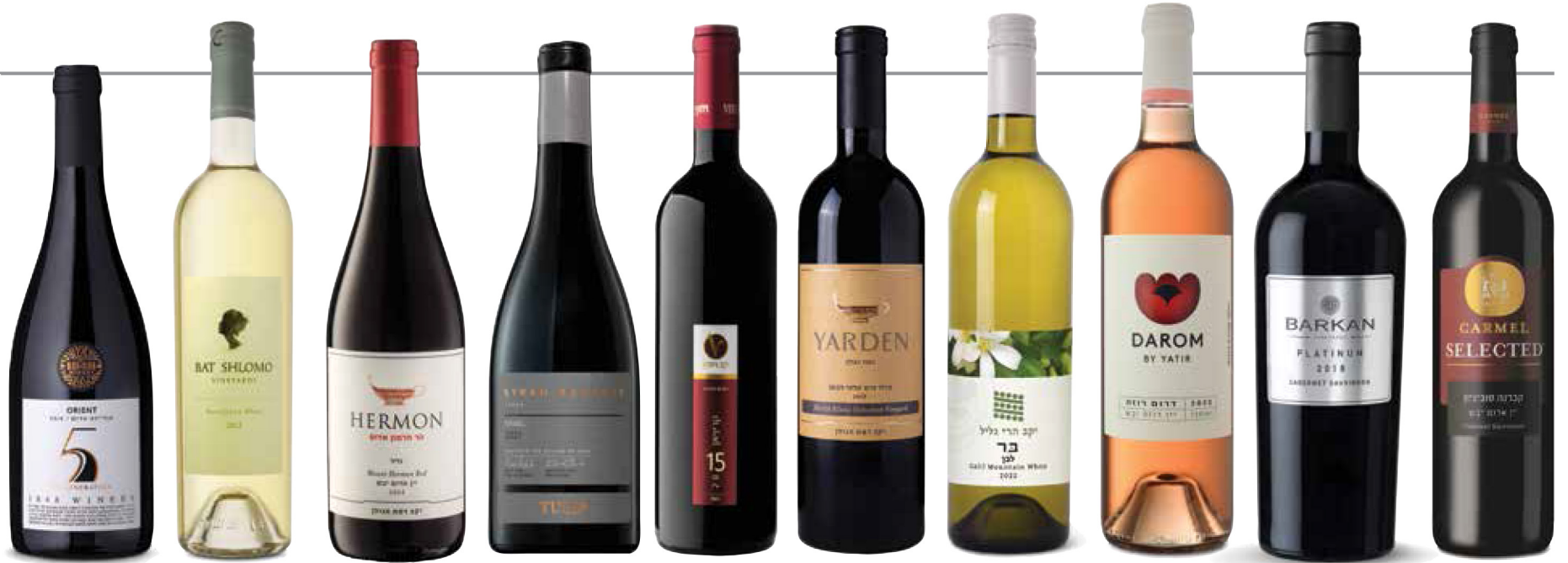
(FROM L) 1848 Orient Red 2021; Bat Shlomo Sauvignon Blanc 2022; Golan Heights Mount Hermon Red 2022; Tulip Syrah Reserve 2021; Vitkin Carignan 2020; Golan Heights Yarden Allone Habashan Merlot 2018; Galil Mountain Bar White 2022; Darom Rose 2022; Barkan Platinum Cabernet Sauvignon 2020; Carmel Selected Cabernet Sauvignon 2022.

2021. Such a pleasure to taste a dry Gewurz in Israel. It has all the spice and aromatics you look for, and you would expect a touch of sweetness to follow. A very nice, original wine from the 900-meter-elevation vineyards in the Jerusalem mountains. I could have also confidently recommended its Cabernet Franc and Sauvignon Blanc.