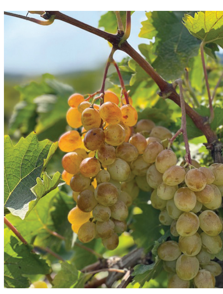
DABOUKI, AN indigenous grape variety, produces large vellow grapes with a mottled skin.