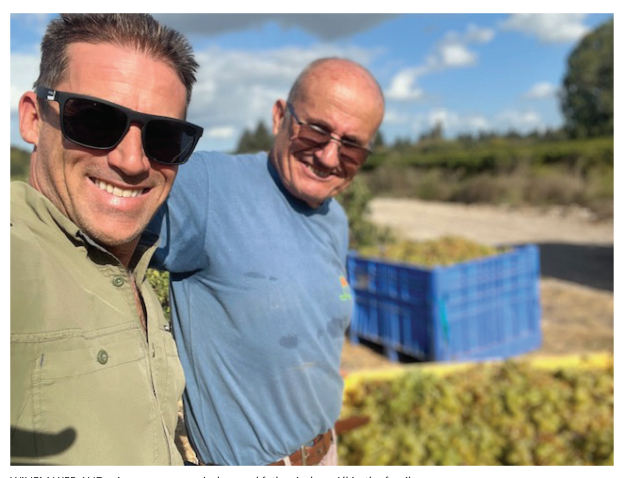
WINEMAKER AND wine grower, son-in-law and father-in-law: All in the family.